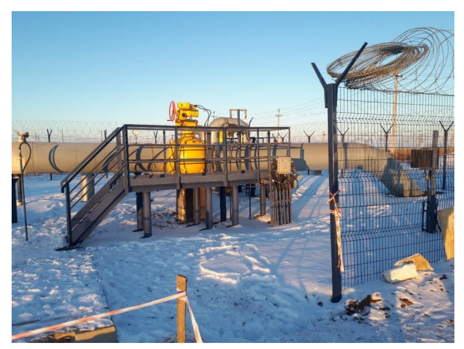
Figure C: New DN700 Pipeline

Number: QMV 2.530.A12-1_en Version: 1.0 Page: 15 of 31 Valid as of: 2020-01-01