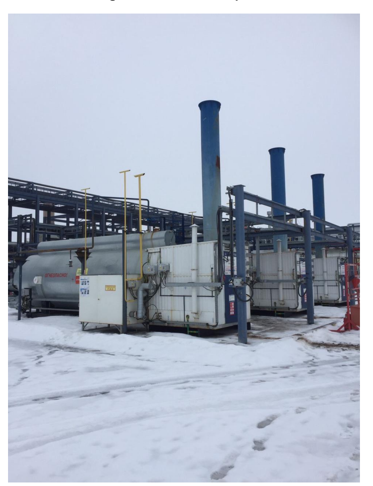
Figure D: Oil and gas processing facilities