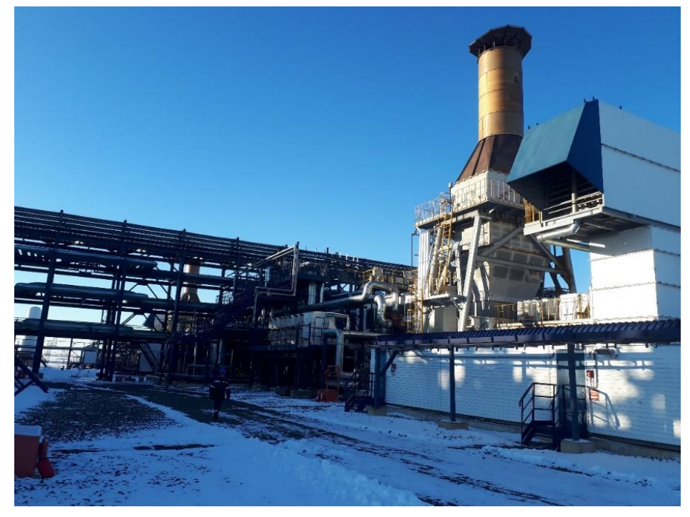
Figure B: New compressor unit

The following pictures provide some impression of the project activity: