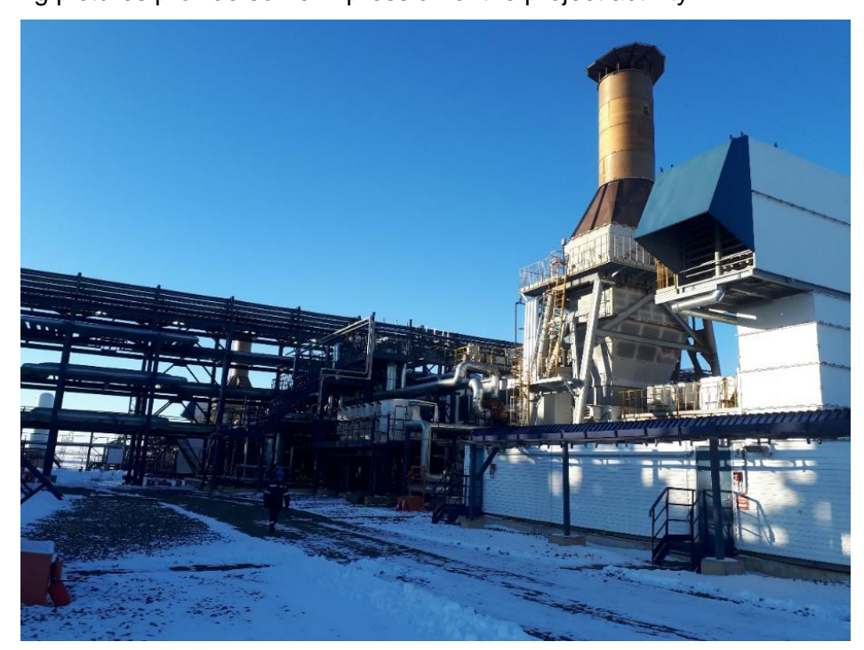
Figure B: New compressor unit

The following pictures provide some impression of the project activity: