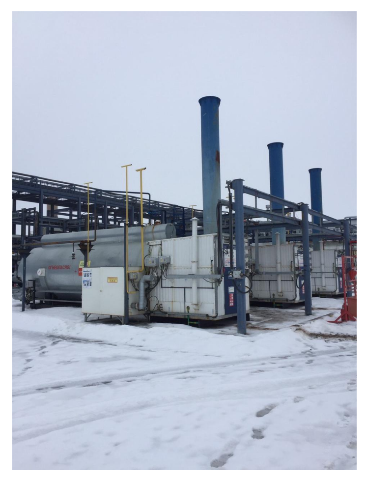
Figure D: Oil and gas processing facilities