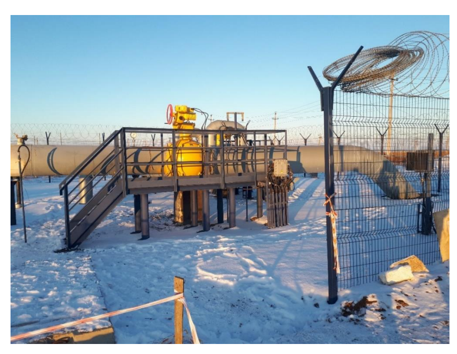
Figure C: New DN700 Pipeline