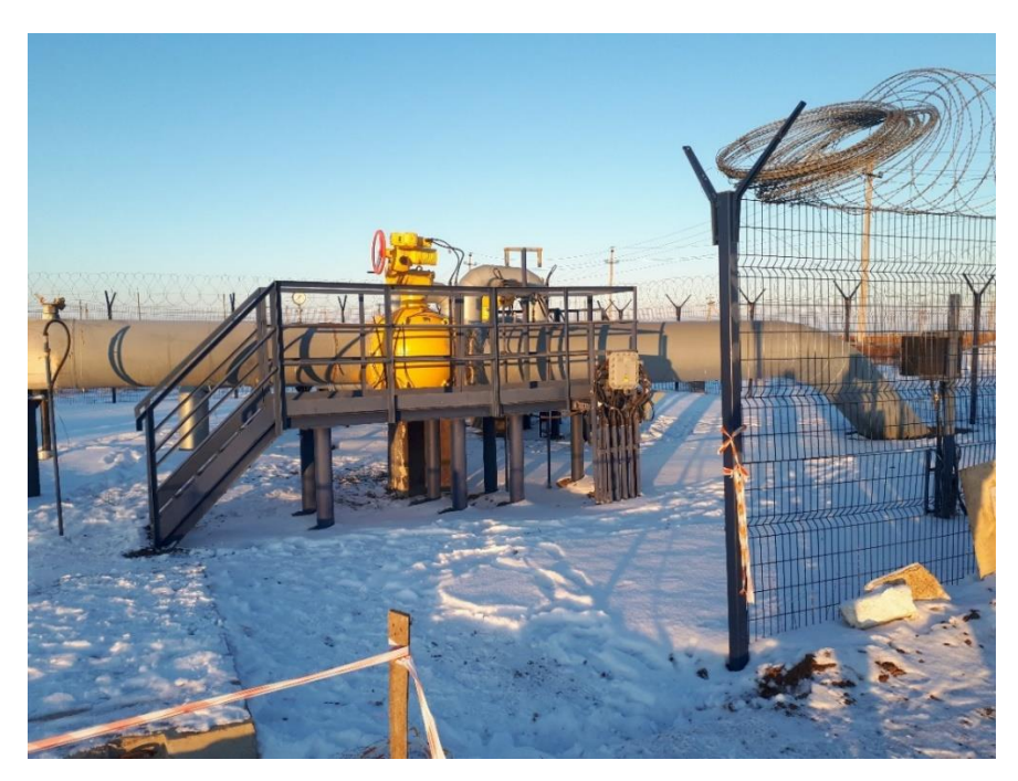
Figure C: New DN700 Pipeline