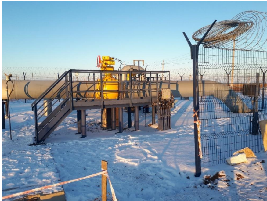
Figure C: New DN700 Pipeline