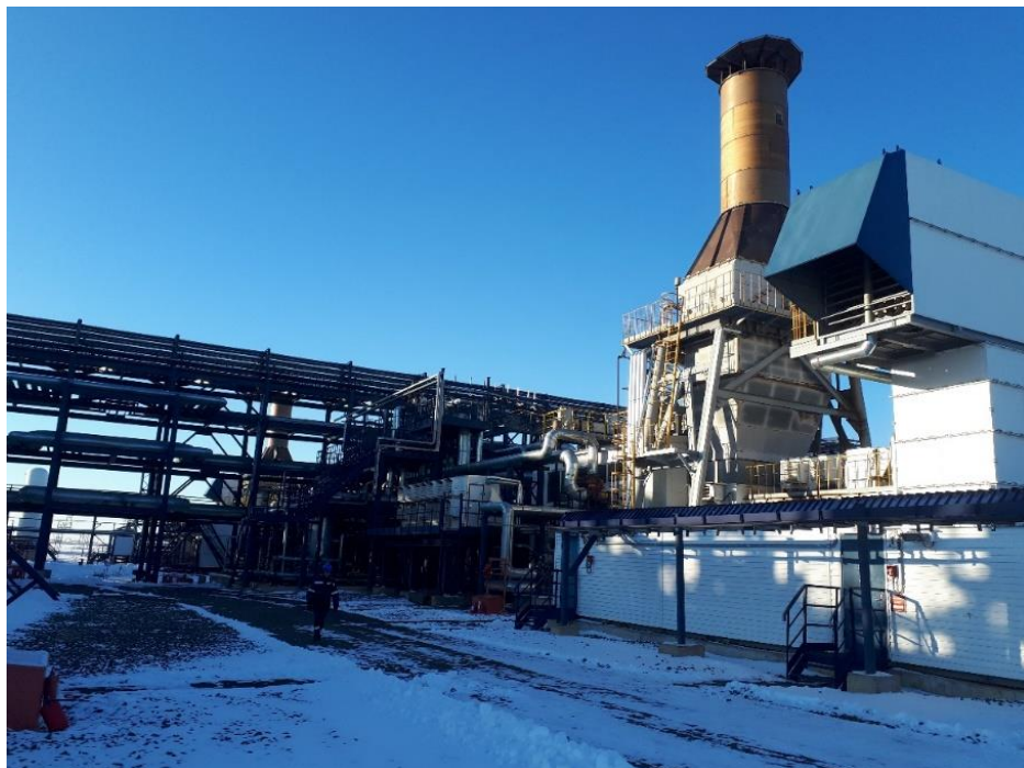
Figure B: New compressor unit

The following pictures provide some impression of the project activity: