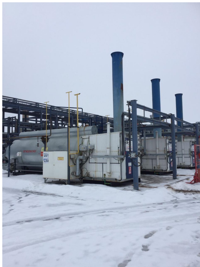
Figure D: Oil and gas processing facilities